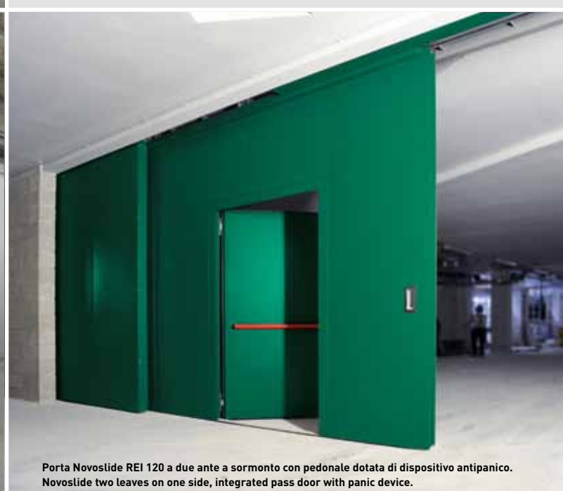
Porta Novoslido REI 120 a due ante a sormonto con pedonale dotata di dispositivo antipánico. Novoslido two leaves on one side, integrated pass door with panic device.