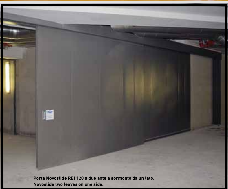
Porta Novoslido REI 120 a due ante a sormonto da un lato. Novoslido two leaves on one side.