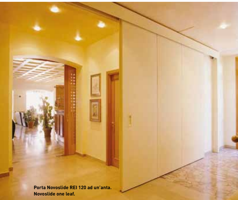
Porta Novoslido REI 120 ad un'anta. Novoslido one leaf.